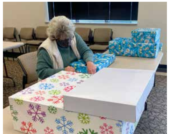
Inter-County Energy employees shop for Christmas Blessings gifts and wrap them for each family or individual. Photos: Inter-County Energy employees